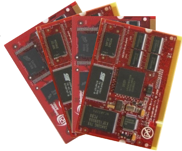
Selection of LPC2000/3000 OEM Boards